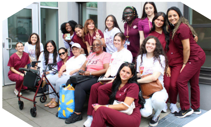
DENTAL HYGIENE STUDENTS WERE HAPPY TO SHARE TECHNIQUES THAT ENCOURAGE GOOD ORAL HEALTH - AT CATHERINE TODD SENIOR HOME, JERSEY CITY, NJ