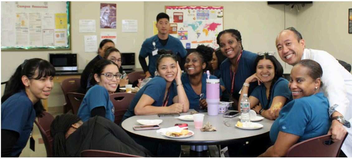
LEARNING AND LUNCHING WITH THE NURSING DEPARTMENT!