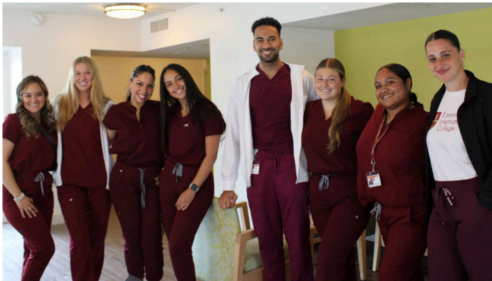
ANOTHER SUCCESSFUL OUTREACH EVENT IN THE BAG!