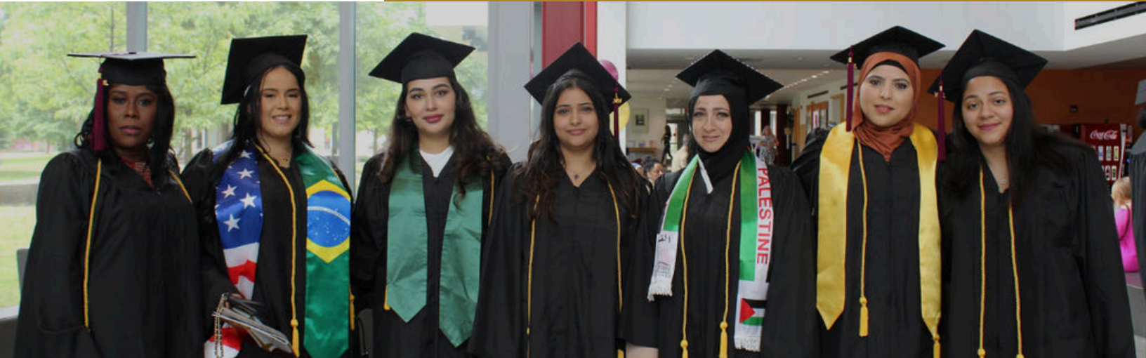
A JOB WELL DONE! NEW GRADUATES CELEBRATING THEIR ACADEMIC SUCCESS!