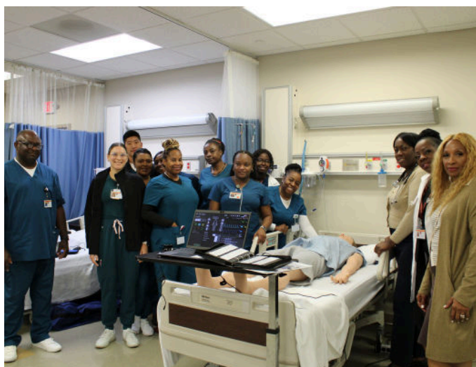
INTERACTIVE SIMULATION DAY WITH MEDVISION

Faculty members shared their professional experiences, discussed various career paths in nursing, and provided advice on succeeding in the program. The Chat and Chew aimed to foster stronger relationships between students and faculty, creating an open environment for learning and growth within the EIC nursing community.